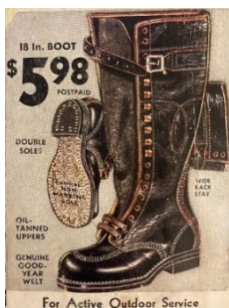
7:National Bellas Hess Co. Inc. Autumn 1931, Winter 1931-31

Lucky for you, men's era shoes have not changed much from those you can find in modern stores.