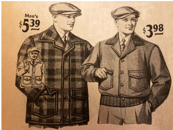
5:Montgomery Ward & Co., Spring and Summer 1928

To add to your look, a sleeveless or long-sleeved, V-neck sweater could be worn. A shawl collar long sleeve pull-over or button up sweater could be added for a cool fall drive. Plaid flannel jackets and leather or duck jackets, falling short on the waist are still available in vintage shops. Bozeman Vintage carries a variety of vintage menswear for everyday dress. They also have a storefront in Bozeman, MT. Hunting and outdoor jackets made of