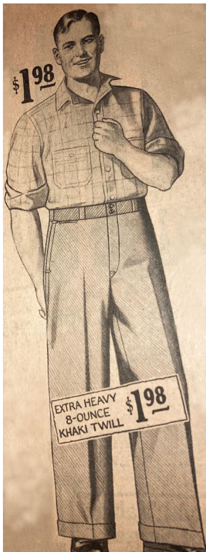
1:Montgomery Ward & Co., Spring and Summer 1928

How does the Model A man dress when he isn't a suit and tie or overall wearin' kinda guy? There are plenty of choices to give your Model A excursion an era feel. Tailored Garments by the Women's Institute of Domestic Arts and Sciences states, "Shirts for men are really of four types – the dress shirt, the negligee shirt, the outing shirt, and the work shirt." Besides the bosom on a dress shirt, the main difference between the rest is the material used to construct the shirt. A work shirt will be used rougher, laundered often, and is made to be mended to save money. Your focus should be on the outing and work shirt. Long sleeved button up shirts made of cotton, flannel, wool, or blends of these fabrics are common. A flannel shirt in plaid or solid colors would fit in perfectly at the local general store around the checker board. A modern, long-sleeved button up dress shirt is a good start. Referencing the Fashion Guidelines, look for solid colors, striped or figured designs in harmonizing or contrasting colors. Ties were not a requirement, but don't forget you can also use bowties. One pocket, two pocket or no pocket shirts are seen in era advertisements.