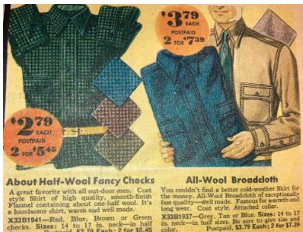
2:National Bellas Hess Co. Inc. Autumn 1931, Winter 1931-31

OverAttired Vintage Fashion carries a variety of vintage clothing and are always adding to their inventory. If you are feeling adventurous, broadcloth short sleeved sport shirts were starting to come into existence at the end of the Model A era. Polo shirts made of knit fabric with 3 buttons also fall into this category.