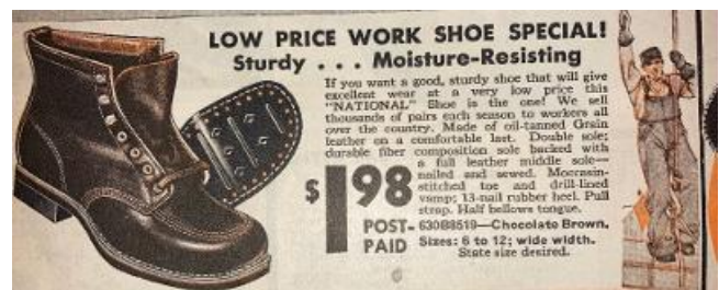
6:National Bellas Hess Co. Inc. Autumn 1931, Winter 1931-31

Low top, high top, cap toe and plain toed shoes and boots were available. Square and round toe shoes were seen in