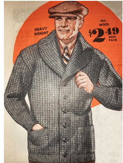
4:National Bellas Hess Co. Inc. Autumn 1931, Winter 1931-31