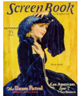
Garbo in the “hat that started it all,” 1930.

The Empress Eugenie had been the wife of Napoleon III, who ruled France from 1853 to 1871. She set the original fad for a little perched hat with a plume back in 1860. Seventy years later, another widely influential trend setter, Greta Garbo, was credited with (or blamed for) having revived the fashion when she wore an “Empress Eugenie hat” in the 1930 movie Romance . Felt and velvet were the favored materials, with black, “mascara brown,” “kiltie green” and “brandy wine” being the favored colors for fall. The regard for romantic, old-fashioned styles carried over into other accessories that season too – from French Colonial-influenced shoes to Victorian revival jewelry, from “Empress Eugenie” miniatures to cameos. Beauty salons were quick to offer “Empress Eugenie” hair styles, also.