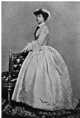
Empress Eugenie of France, 1865.