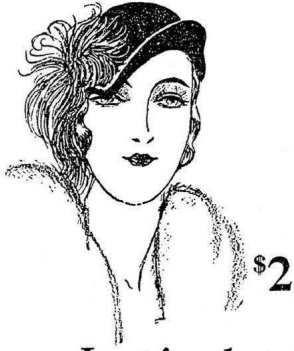
Inspired by Empress Eugenie